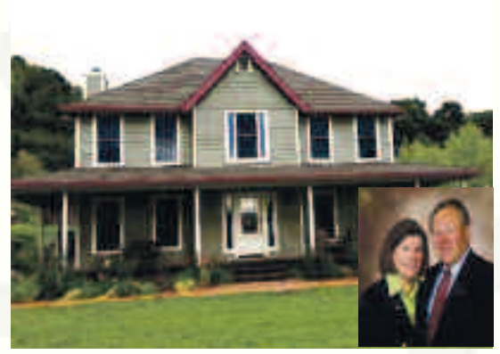
Alhambra Valley ~ Beautiful solar powered 3000sf farmhouse style hm on 6+ acres backing to open space, built in 2000. In a private valley w/a peaceful natural setting, this 4 bed/2.5 bath hm w/ lg bonus rm. Truly one of a kind home. $1,499,000